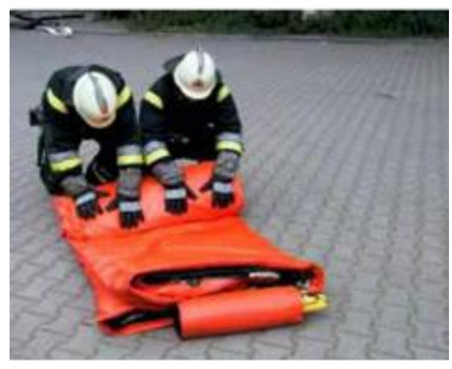
Pic. 3 Pic. 4

Place the packing bag on the ground and carry the rescue cushion on to the middle of the packing bag. Make sure the BA cylinder symbol is at the BA cylinder side (pic. 5).