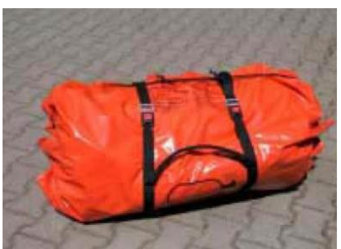
Pic. 5 Pic. 6

At the station immediately refill the BA cylinder.